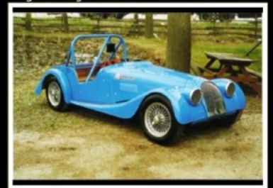
Morgan Vintage Race Car