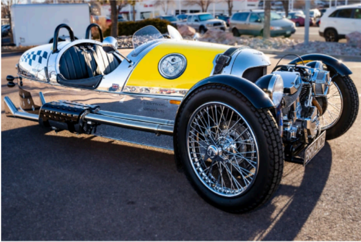
This 2014 Morgan 3-Wheeler Brooklands Edition sold on BaT for US$52,000 on April 8, 2023.