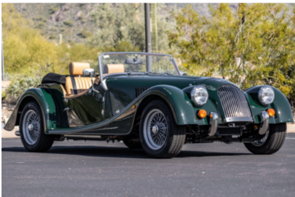
This 1965 Morgan Plus 4 Tribute was bid to US$60,000 on BaT but did not meet reserve.