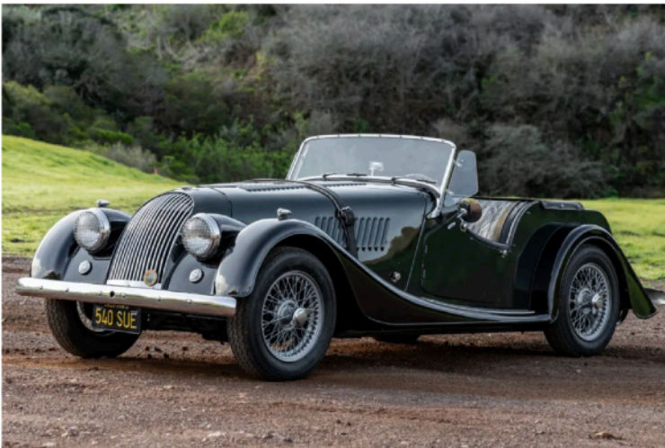
This 1957 Morgan Plus 4 sold on BaT for US$47,500 on April 7, 2023.