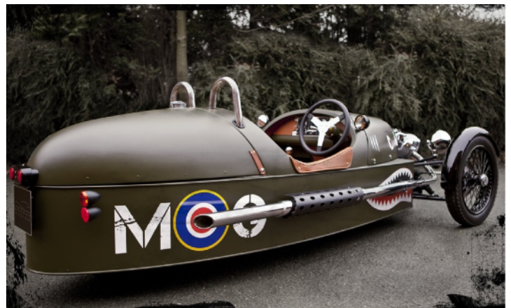
An original 2012 Morgan 3-Wheeler

Of course there is and after getting our first look at what is now called the Super 3 back in February, we've now driven it. So don your Biggles glasses, chocks away and strap yourself in as we take to the skies, or rather the roads of Worcestershire.