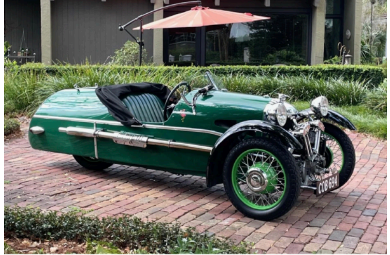
This 1936 Morgan MX4 Super Sport with trailer sold on Bat for US$40,000 on April 2, 2023.