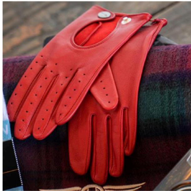
DENT'S DRIVING GLOVES