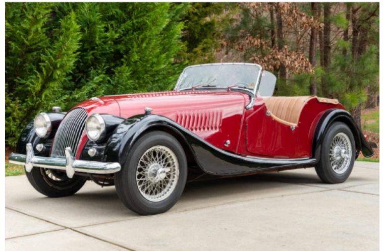
This 1965 Morgan Plus 4 was bid to US$27,750.00 on BaT on April 18, 2023 but the reserve was not met.